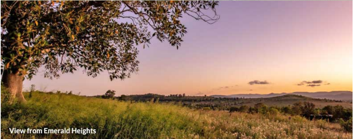
View from Emerald Heights